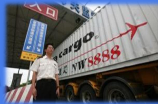
Yongchuan Customs Check Point