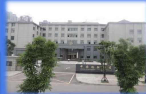
Chongqing Customs Yongchuan Office

Effort to establish a comprehensive FTZ. Early completion of a port for lumber.