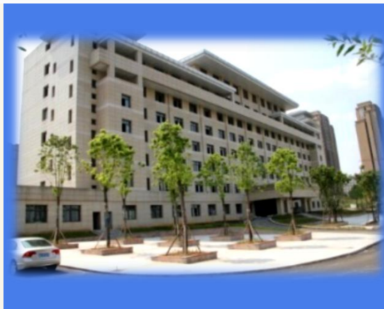
Yongchuan Customs Building